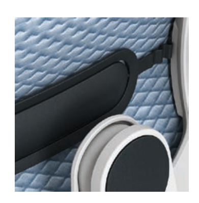
Beneficial. The lumbar support is height adjustable and is also available with optional depth adjustment.