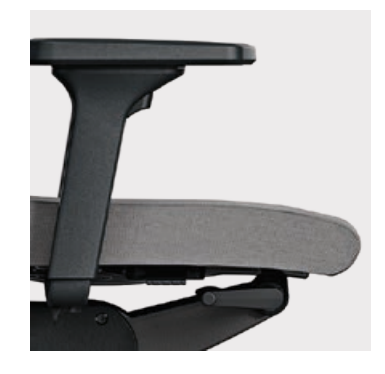
Adjustable. Depending on body size, the sliding seat can be moved up to 60 mm.

The flexible suspension of the backrest provides pleasant support for the back, even during turning and side movements.