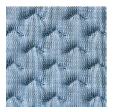
Comfortable. The knitted upholstery offers high seating comfort and bribes with a refined 3D quilting, which gives a pleasant haptics with an innovative look.

Groundbreaking. In addition to height-adjustable armrests, 4D armrests are optionally available which can be intuitively adjusted in all directions.